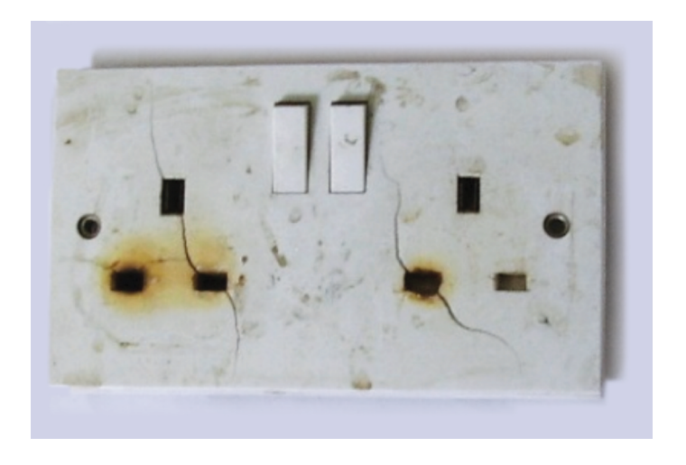
FIGURE 3: EXAMPLE OF A BADLY DAMAGED TWIN SOCKET OUTLET DISPLAYING THE EFFECTS OF CONSIDERABLE OVERHEATING

Only just over half of the housing stock built before 1980 has been updated to include all 5 of these safety features. Less than two thirds have RCD protection or an up to date consumer unit.