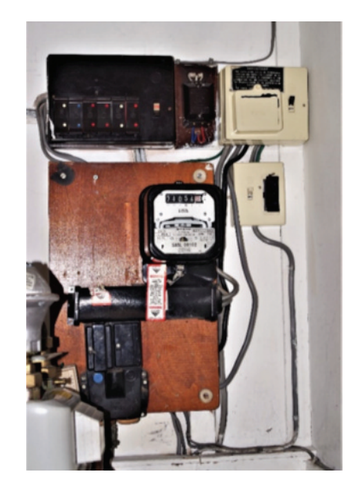
FIGURE 1: MAINS PROTECTION AND METERING IN OLD RESIDENTIAL BUILDING