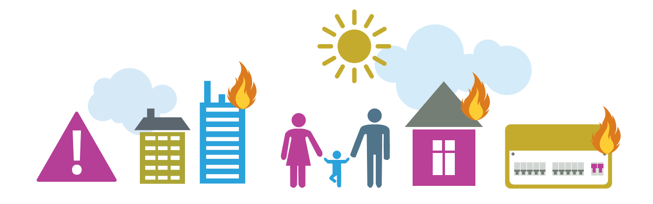
FIGURE 4: UK GOVERNMENT STATISTICS SHOWING THE REDUCTION OF INCIDENCE OF ACCIDENTAL FIRES CAUSED BY COOKING APPLIANCES, ELECTRICAL DISTRIBUTION AND OTHER ELECTRICAL APPLIANCES 2010/11 TO 2016/17