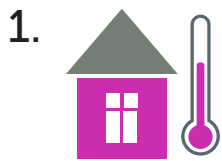
1. Desired room temperature

A supplier will normally design an underfloor heating system based on certain parameters, such as: