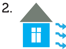
2. Heat loss of the room