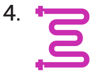
4. Insulation below the floor