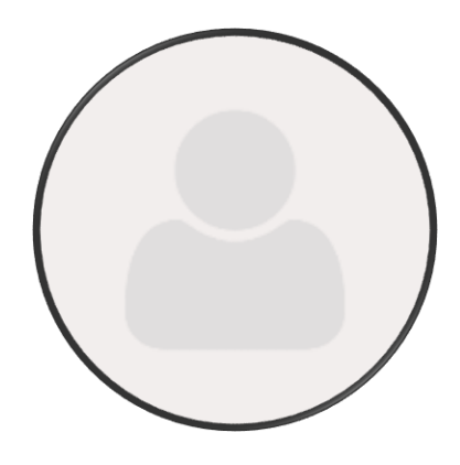
To be hired Sustainability Executive